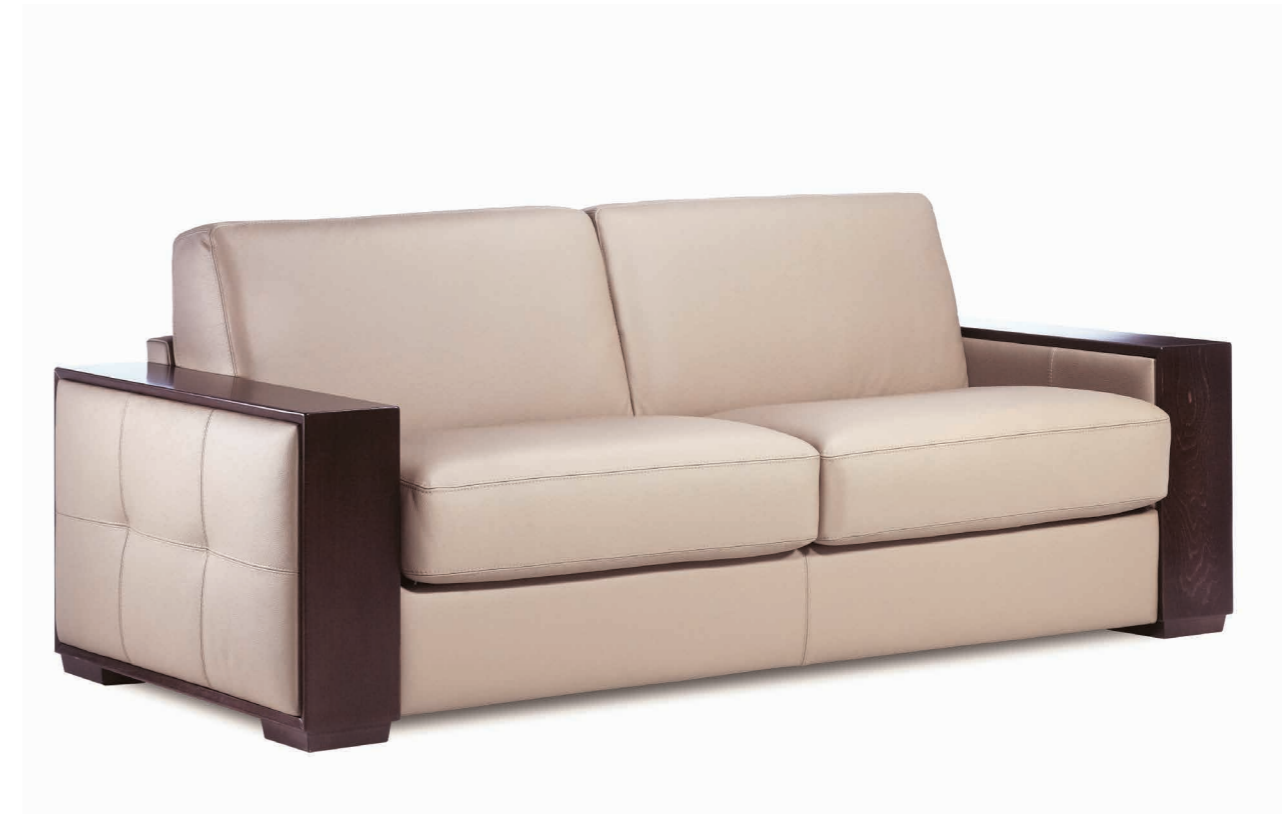
MADRID design Studio Neology