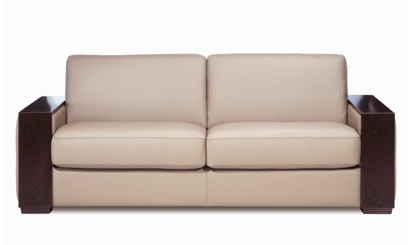
3 seater sofa Leather: Toledo Mocca